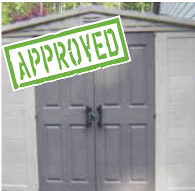
Figure B Vinyl Configuration RECOMMENDED

You, the applicant, have the sole responsibility for ensuring full compliance with setbacks, easements, permits, fees, ordinances and restrictions associated with the modification of your property.