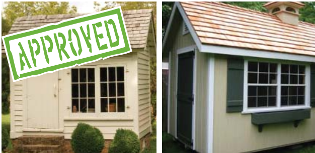
Figure A Wood Configurations RECOMMENDED