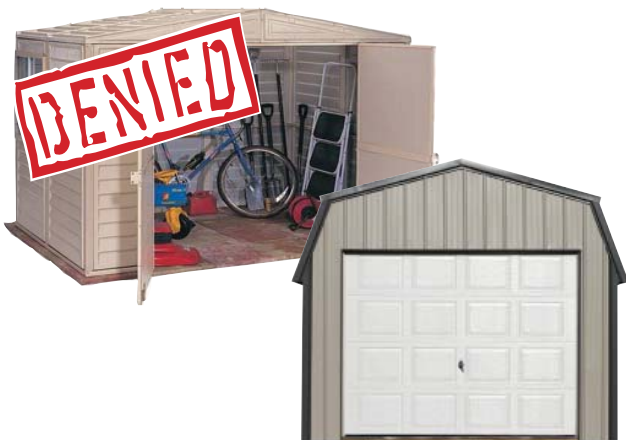
Figure C Metal and Garage Door Configurations NOT RECOMMENDED

Approval by Property Improvement Committee does not constitute approval by any other jurisdiction, regulation or restriction.